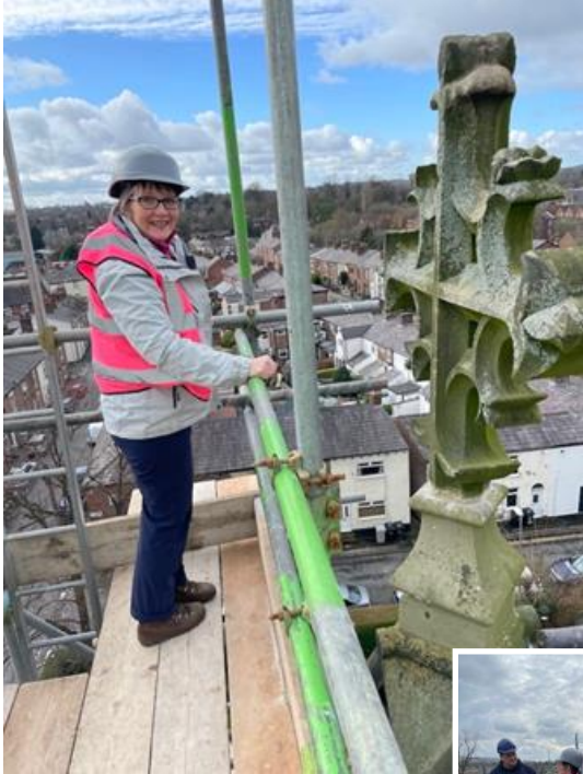
Our stone cross also needed re-pinning as it had become unstable,