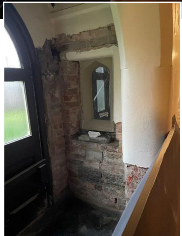
Dry rot investigation work in the cloister.